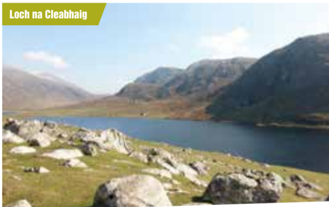
Loch na Cleabhaig

To the north, the houses of Mealasta on Lewis can clearly be seen - a short hop by boat, but a 2 hour drive by road.