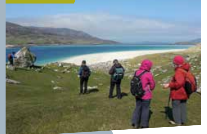
Looking towards Scarp

“This spectacular coastal hike at the south west corner of North Harris must surely rank as one of the finest in Scotland. Flower filled meadows, turquoise seas, huge deserted beaches, wild mountain landscapes, dramatic off-shore islands and a good chance of spotting eagles - this is a great walk to do over and over again!”